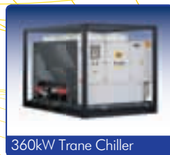
360kW Trane Chiller