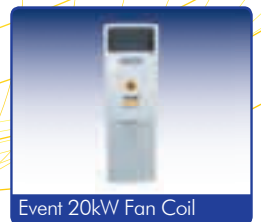
Event 20kW Fan Coil