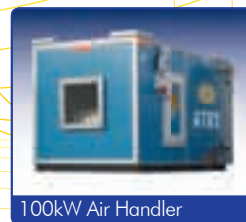
100kW Air Handler