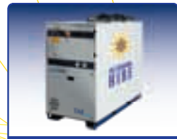
MTA 50kW Chiller

All Seasons Hire specialise in offering the most energy-efficient rental chillers, capable of being used in a wide variety of environments and varied applications including air conditioning and process cooling.