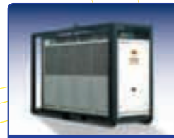
100kW Trane Chiller