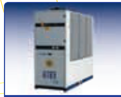
MTA 100kW Chiller