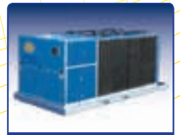
Euro 200kW Chiller