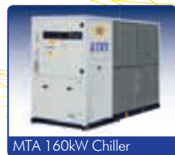
MTA 160kW Chiller